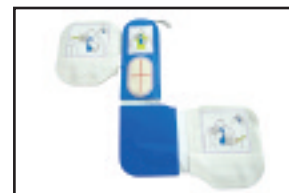
CPR-D•padz offer clear anatomical placement illustrations and a CPR hand positioning landmark.