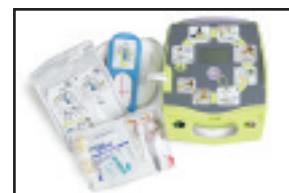
CPR-D•padz come complete with rescue essentials including a barrier mask, a razor, scissors, disposable gloves, and a towelette.

Zoll Medical Your Safety Company 111 Quarry Road Chambersburg PA 17202 phone 800-548-3920 fax 717-267-2369