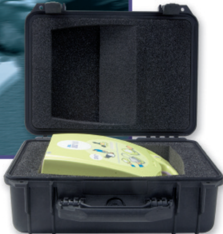
Large Case (19" x 15.4" x 7.6") (48.3 cm x 39.1 cm x 19.3 cm)

Unbreakable, Watertight, Dustproof, Chemical Resistant, and Corrosion Proof.