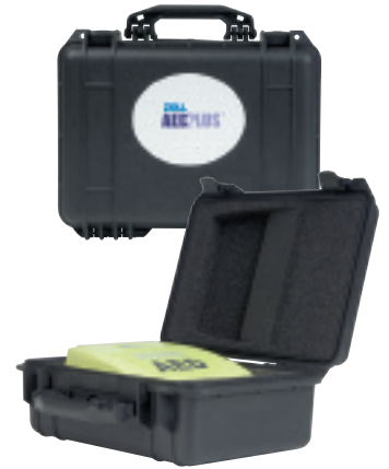
A Rugged Case for the First and Only Full-Rescue AED